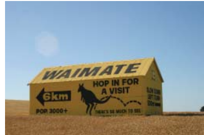
Economic Development & Promotions

The provision of a walk in library service offering a wide collection of reading material and electronic information