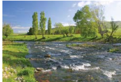
Water Supply - Rural