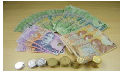
Investments and Finance