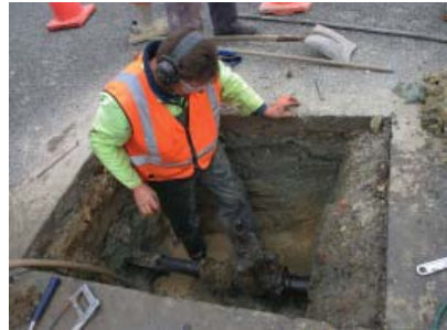
Water Supply - Urban

The provision of a clean safe supply of water for drinking, stock, irrigation and fire fighting purposes