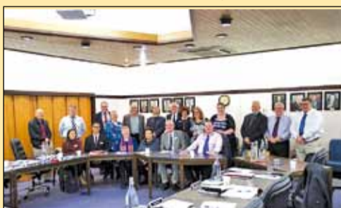
Environment Canterbury and Waimate District Council Councillors

Recently Council hosted Environment Canterbury Councillors and Chief Executive at a meeting where we highlighted and discussed a number of items that are significant to our district such as clean air, water quality, consent monitoring, roadside spraying, Wainono Drainage Board and the St Andrews Septic Tank Global Consent application. It was a very useful meeting and we will continue to work positively together to better meet the needs of our district.